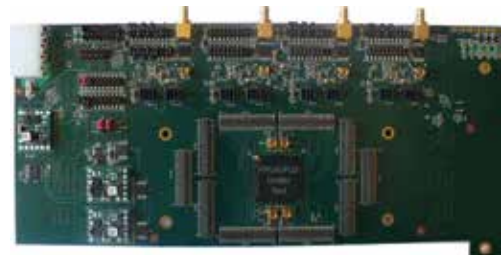
DO-254/CTS Custom Daughter Board

The design must be tested in the target device per RTCA/DO-254 specification sections 1.1 and 6.3.1. DO-254/CTS consists of a custom daughter board that contains the specific family/package or part number of the FPGA/PLD device from vendors such as Altera, Lattice, Microsemi (Actel) and Xilinx.