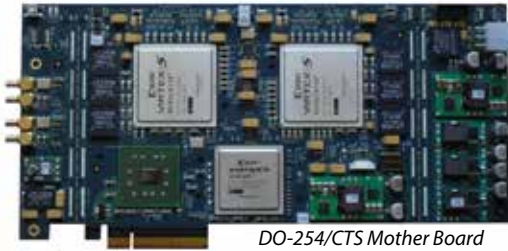
DO-254/CTS Mother Board

To assess, at device level, that no unacceptable robustness defects remain, FPGA requirements-based testing should be defined to cover normal and abnormal input conditions. However, FPGA requirements-based testing is difficult using the target board. DO-254/CTS augments target board testing to facilitate requirements-based testing at the FPGA level.